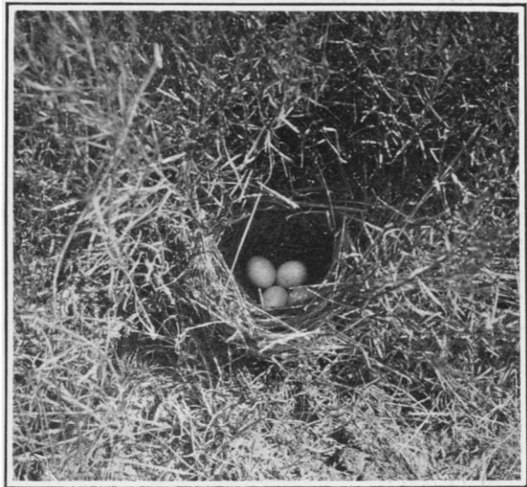
NEST AND EGGS OF THE CASSIN SPARROW

These statements seem to establish the fact beyond question that the extreme northwestern limit of the Cassin Sparrow as it is known at present, is the western boundary of Kansas, but the above records for Colorado and the finding of nest